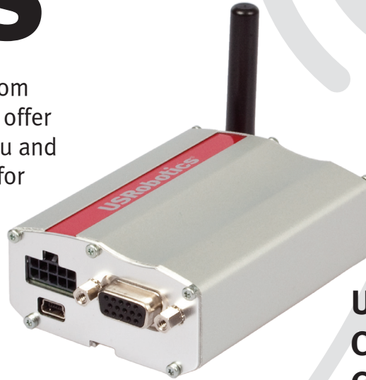
USR3500 Courier M2M 3G Cellular Modem