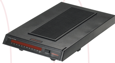
USR3453C Courier 56K Business Modem