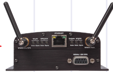
USR3510 Courier M2M 3G Cellular Gateway

Many M2M customers are considering making the transition from analog to cellular but may not be sure what that entails. Compare the process and requirements below to see if making the jump to cellular makes sense for your business or your customers.