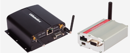
cellular gateways & modems