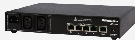
console server management