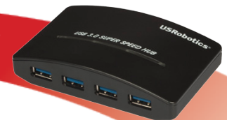
USR8400 4-Port USB 3.0 Hub