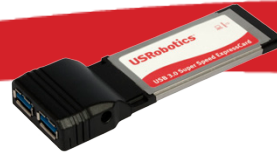
USR8401 2-Port USB 3.0 ExpressCard