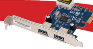
USR8402 2-Port USB 3.0 PCI Express Card