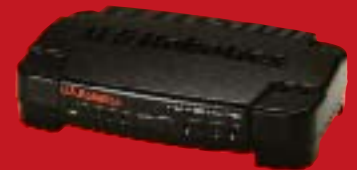
8-Port 10/100 Ethernet Switch – Model 7908