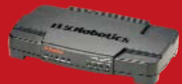
Secure Storage Router Pro – Model 8200