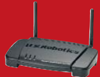
802.11g Wireless Turbo Multi-Function Access Point – Model 5450

Total ADSL solution – U.S. Robotics offers a complete solution of high-speed SureConnect ADSL modems and routers, Ethernet-based networking products, and our new 802.11g Wireless Turbo family of products. U.S. Robotics has everything you need for a complete, integrated ADSL solution.