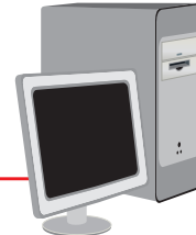
PC Serial Port