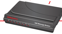
Model 5668D Message Modem